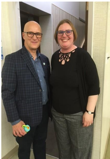
Top left: Enjoying fellowship and refreshments after the covenanting service.